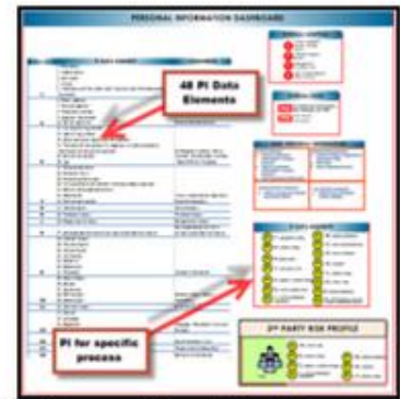
Personal Information Dashboard